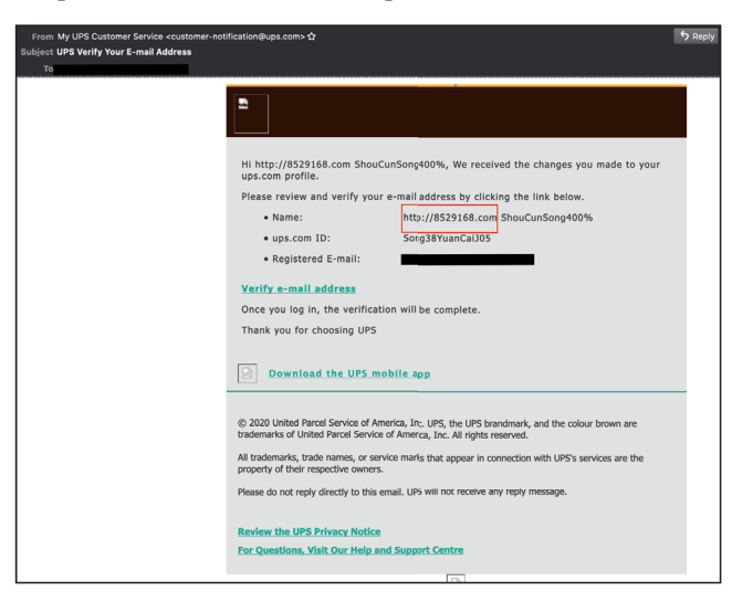
Spam campaign in which emails are sent from UPS and contain a suspicious URL in the text of the email in place of the name of the recipient.

We have seen an increase in spam emails sent from legitimate web pages through open forms. One such campaign caught our attention since it was missed by many of the products in the test. The emails are sent from UPS and contain a suspicious URL in the text of the email in place of the name of the recipient.